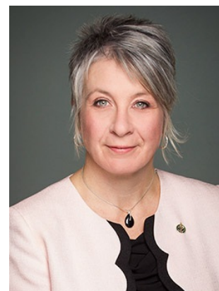
The Honourable Patty Hajdu

The recent federal cabinet shuffle means that we have a new minister. The Honourable Patty Hajdu (pronounced "High-dew") was appointed to the Ministry of Employment, Workforce Development and Labour. I have sent her a letter of congratulations on behalf of our board of directors and our members along with information about ASPECT BC. Further, since I will be in Ottawa for Cannexus at the end of this month, I have also requested meetings with her and her staff and I have requested individual meetings with public servants in Employment and Social Development Canada.