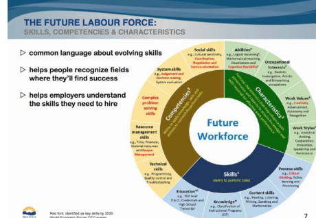
Slide from the Ministry Update - click on image to see full presentation.

The loss of leadership through retirement is making a significant impact on our sector; as was projected. I heard that on Vancouver Island alone, 45% of the leaders from member organizations have retired! I hosted a new leaders networking breakfast, which was well received. I'm setting up a portal so that we can continue the conversation and will keep you posted in future editions of Aspectives .